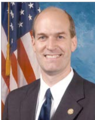
U.S. Representative Rick Larsen 2015 Honorary Chair